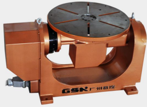
Dual-axis Welding Table HBS150-1

Dual-axis welding table designed for precise rotation and tilting operations.