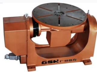
Dual-axis Welding Table HBS150-1