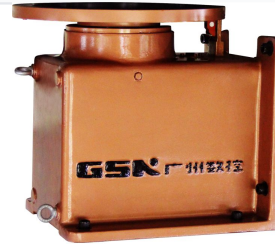
Single-axis Welding Table HBD250-1

Dual-axis welding table designed for precise rotation and tilting operations.