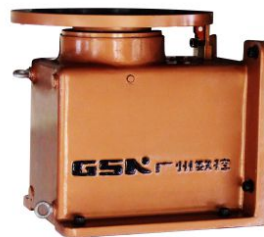
Single-axis Welding Table HBD250-1

Comparison of the dual-axis (HBS150-1) and single-axis (HBD250-1) welding table configurations.