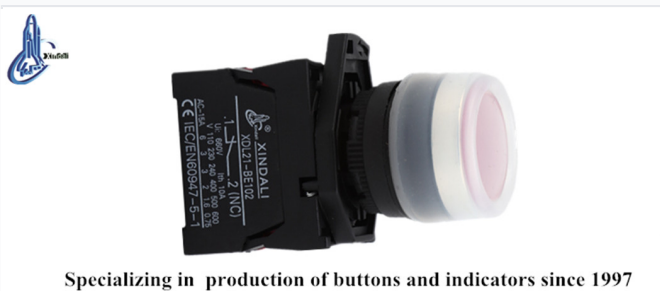
Standard technical specifications and compliance markings for the XDL21 series.