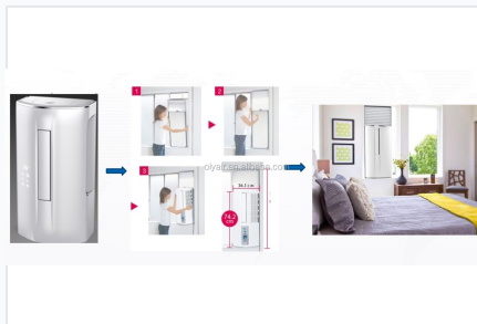
Compact dimensions allow for versatile installation in bedrooms, living rooms, and offices.