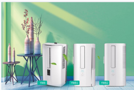
Sleek vertical design that integrates seamlessly into wall and window spaces.