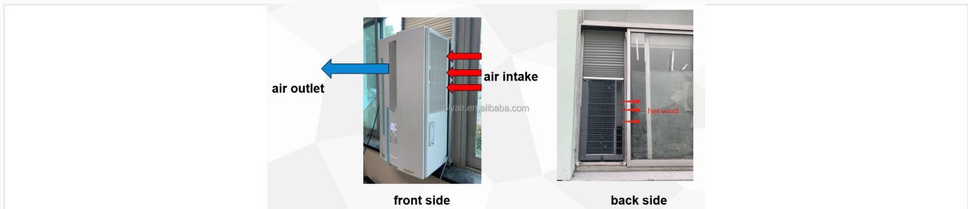
Efficient airflow design with front air intake and rear hot air exhaust.