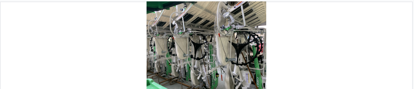
A 6-row walking rice transplanter designed for efficiency and ease of operation.