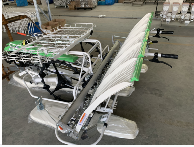
Close-up of the mechanical planting arms and seedling trays.