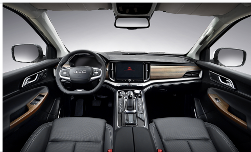
The interior features a 12-inch screen and ergonomic, premium seating.