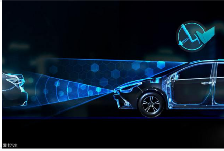
Equipped with advanced safety technology to aid in collision avoidance.