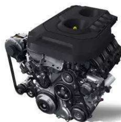
Powerful 2.0 GTDi engine engineered for efficiency and power.