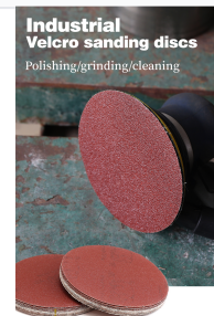
Industrial Velcro sanding discs Polishing/grinding/cleaning

Available in both vacuum hole and non-hole configurations to suit different power tool requirements.