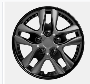
Example of two-coloured paint finish hubcap.