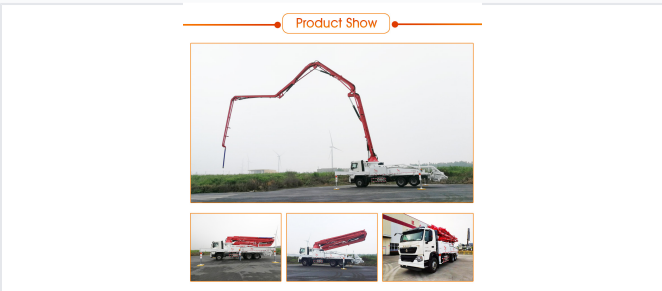
The 43m reach truck-mounted boom pump designed for high-performance concrete placement.