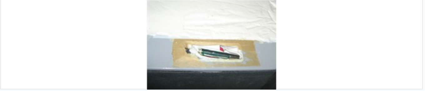
Intelligent temperature sensor for low-temperature automatic compensation.