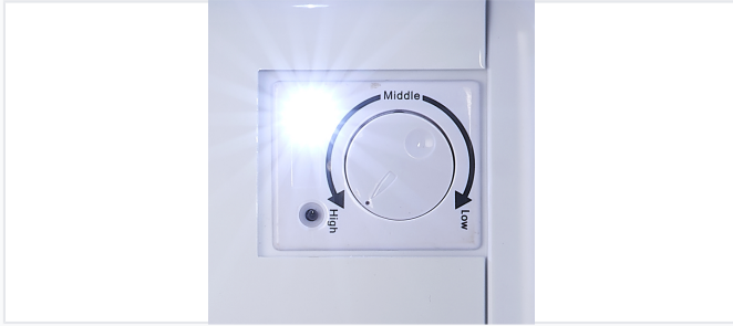
Easy-to-use temperature adjustment with High, Middle, and Low settings.