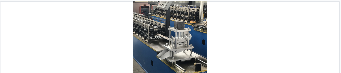
A robust roll forming station engineered for industrial shutter door production.