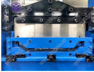
Heavy-duty steel frame construction featuring precision-adjustable forming rollers.