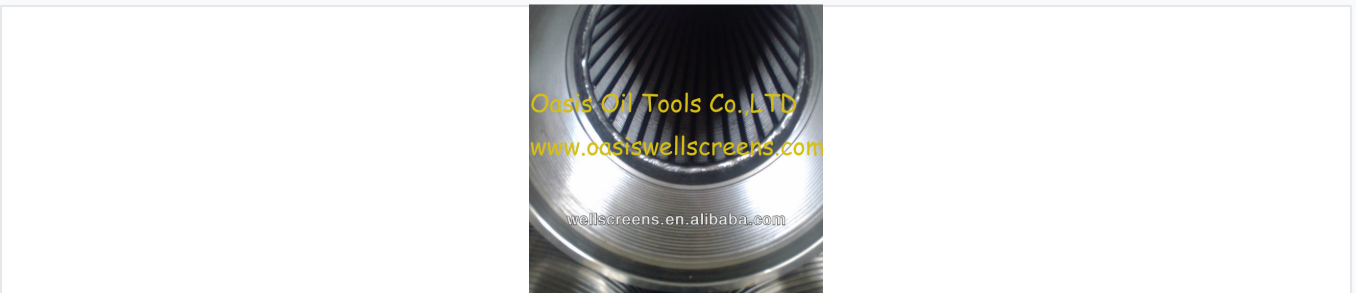
High-quality stainless steel screen featuring reliable API STC threading.