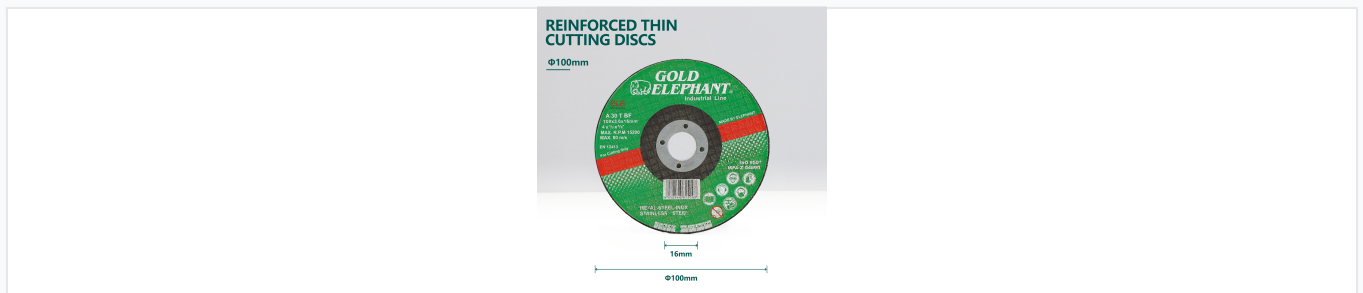
High-performance reinforced thin cutting disc compliant with EN 12413 standards.