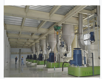
Advanced grinding and packing system for final protein product.