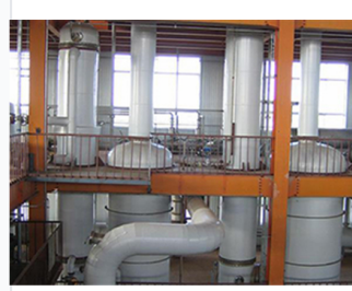
Evaporation and concentration unit for by-product processing.