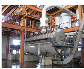
Horizontal vessel for efficient desolventizing and drying.