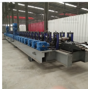
Detailed view of the multi-station roll forming assembly and straightening unit.