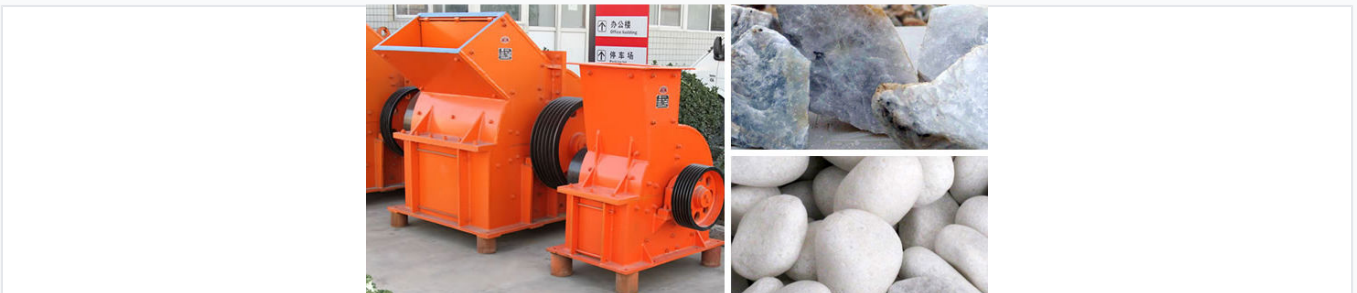
Robust industrial hammer crusher designed for medium-hard mineral processing.