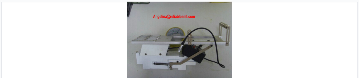
Industrial-grade stick feeder configured for high-speed automated component placement.