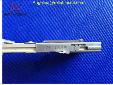
Precision-engineered pickup area ensuring smooth component handling.