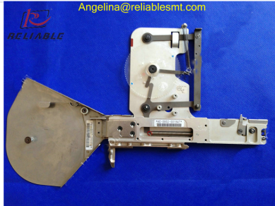
Feeder unit featuring specific part identifiers for compatibility verification.