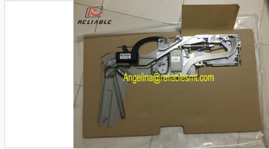
Precision-engineered mechanism for accurate component feeding.