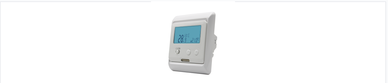
Digital display interface for precise room temperature management.