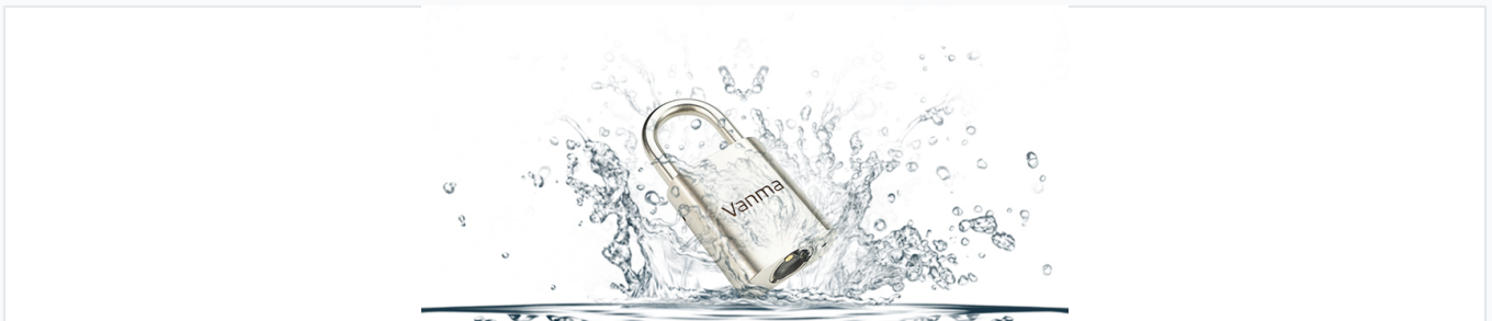
High-security padlock designed for versatile indoor and outdoor use.