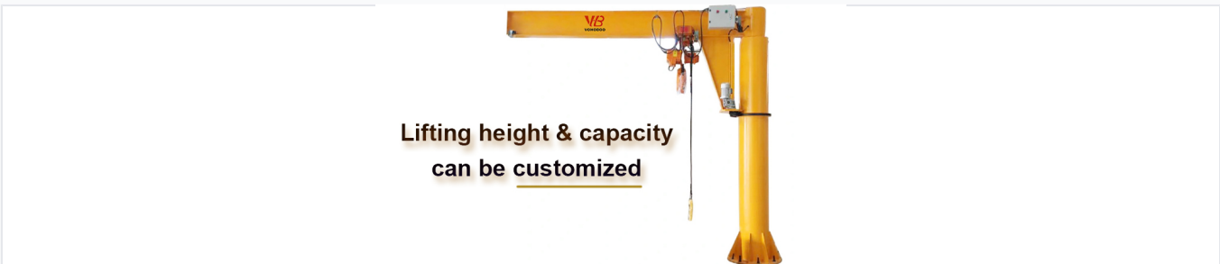
A robust, slewing jib crane designed for versatile material handling applications.