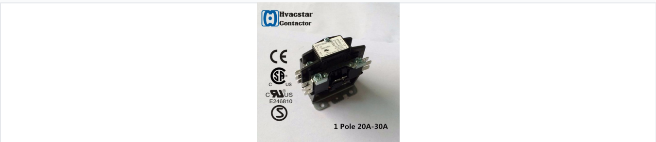
Front view of the single-pole AC contactor showing terminal configuration and certification markings.