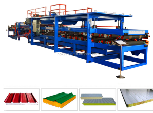
Multi-stage forming process for high-precision panel production.