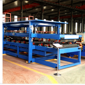
Control station for monitoring and adjusting the roll forming process.