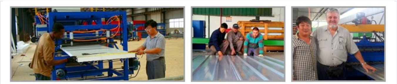
Fully automated production line for roof and wall panels.