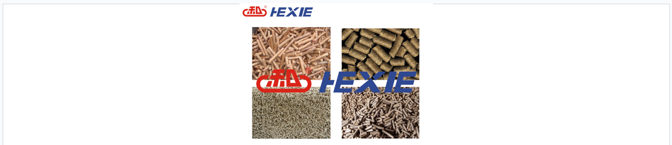
Examples of large-diameter ruminant feed pellets produced by the granulator