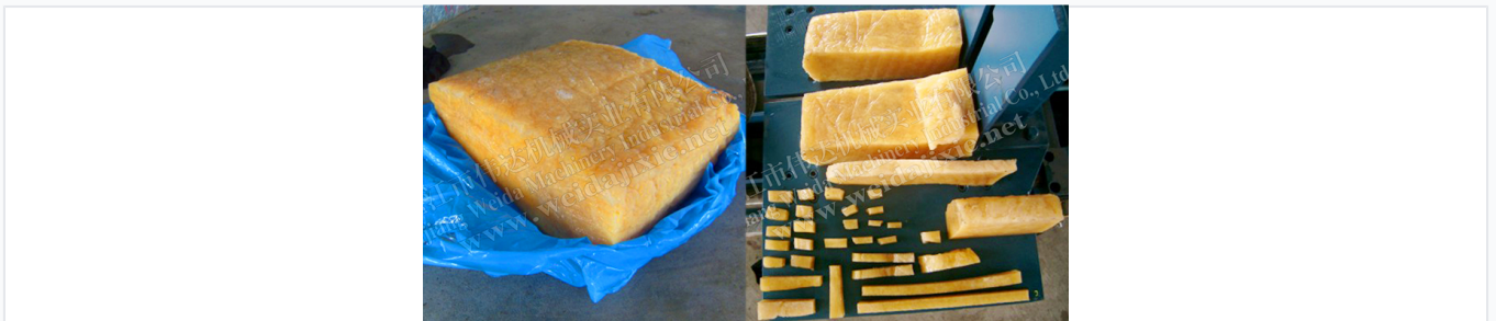
A high-precision rubber slicing machine designed for consistent block processing.