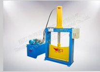
VERTICAL HYDRAULIC CUTTING MACHINE