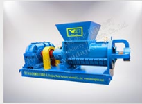
HELIX CRUSHING MACHINE