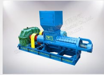
CONTINUOUS OPERATING MIXING MACHINE