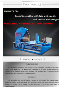
Horizontal hydraulic cutting system with rotating-disc blade.