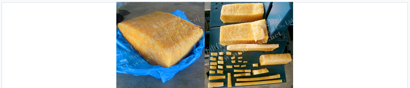
Rotating-disc cutting machine designed for precision rubber processing.