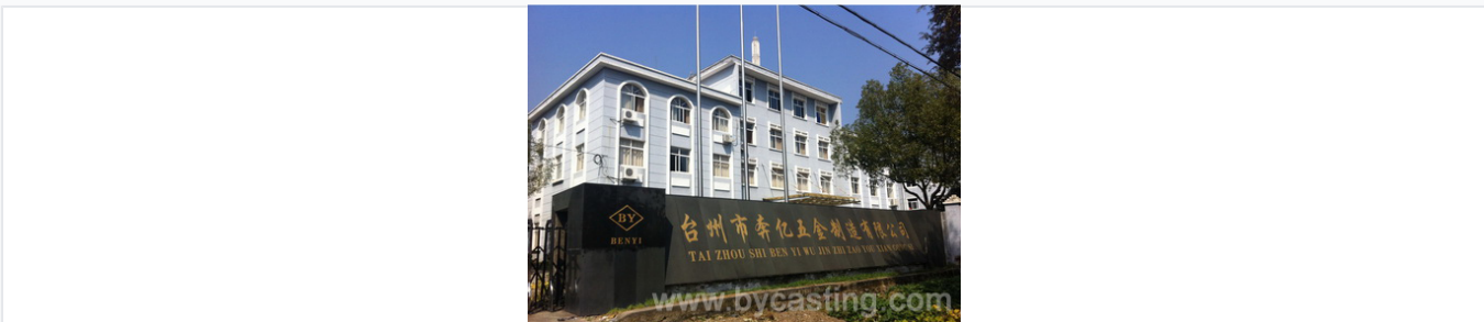
Heavy-duty ripper tip engineered for high-impact earthmoving tasks.

Heavy-Duty Ripper Performance This high-performance ripper tip is precision-engineered for demanding earthmoving and heavy-duty applications. Designed for superior durability and wear resistance, it provides reliable penetration and productivity in tough ground conditions. The component is manufactured using advanced casting techniques to ensure consistent quality and seamless compatibility with compatible machinery.