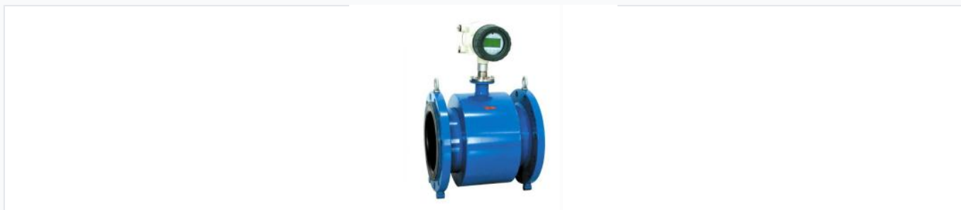
Separated sensor and display unit design for flexible installation.