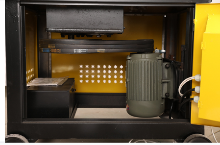
Industrial-grade motor and belt drive system housed within a reinforced protective frame.