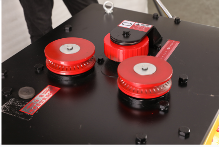
Precision roller system with integrated measurement ruler and safety warning indicators.