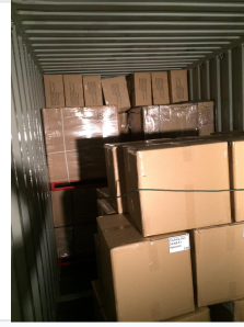
Comprehensive accessory sets and components are securely packed for bulk international shipment.