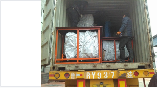
Standard export packaging featuring protective wrapping and a heavy-duty iron support frame.