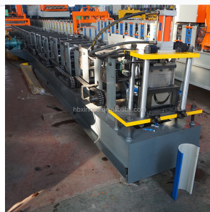
Robust steel frame construction ensures stability during high-speed forming.