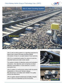
Detection point configuration comprising wheel detectors and connection box.