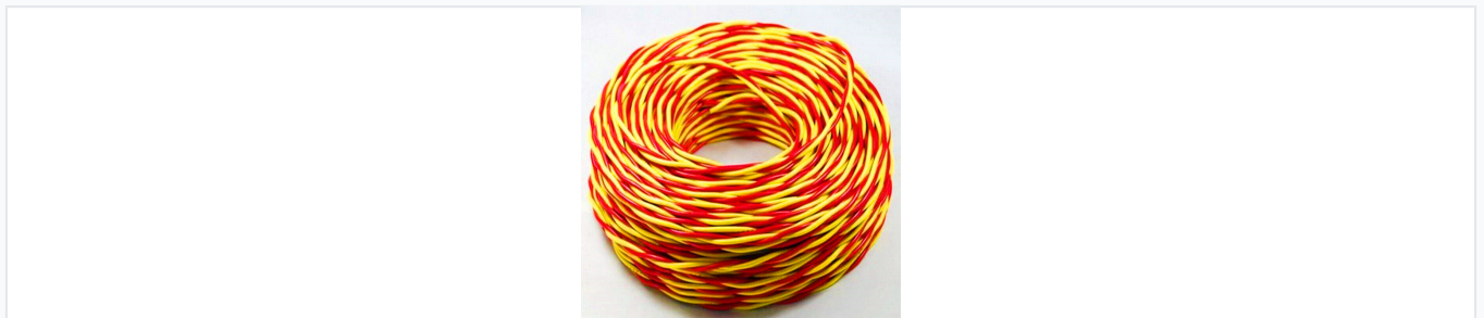
Detailed view of the flexible PVC insulation and twisted structure.