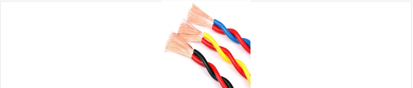
Flexible twisted pair configuration for low-voltage applications.