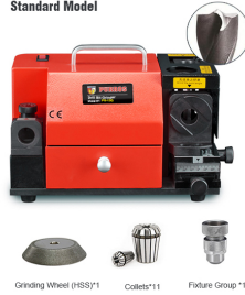
Grinding Wheel (HSS)*1 Collets*11 Fixture Group*1

Standard package includes essential collets and fixture group for precision grinding.