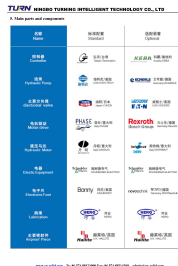
High-quality component configuration including controllers, hydraulic pumps, and motor drives.