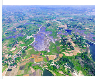
Optimized module placement for maximum sunlight absorption.