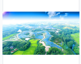
Robust crystalline silicon modules integrated with rural infrastructure.