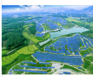
Photovoltaic modules arranged in rows across a terraced landscape.