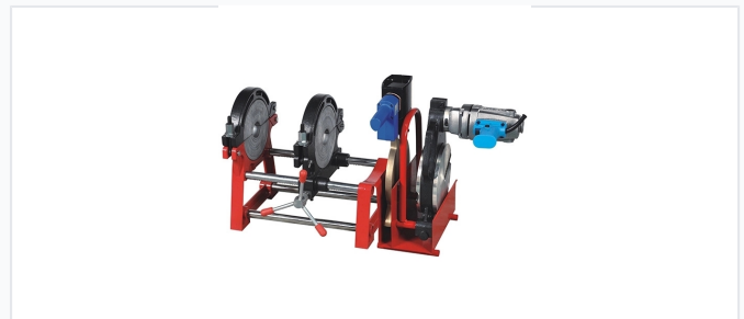
Robust frame design featuring dual clamping systems for secure pipe alignment and uniform melting.