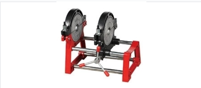
A specialized tool designed for creating strong, reliable, and leak-proof joints in polyethylene pipes.