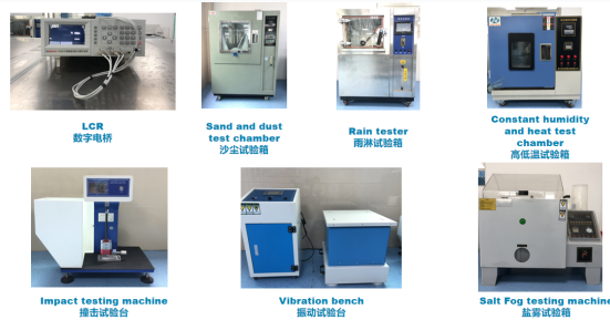
Extensive testing facility used to ensure product durability under harsh environmental conditions.