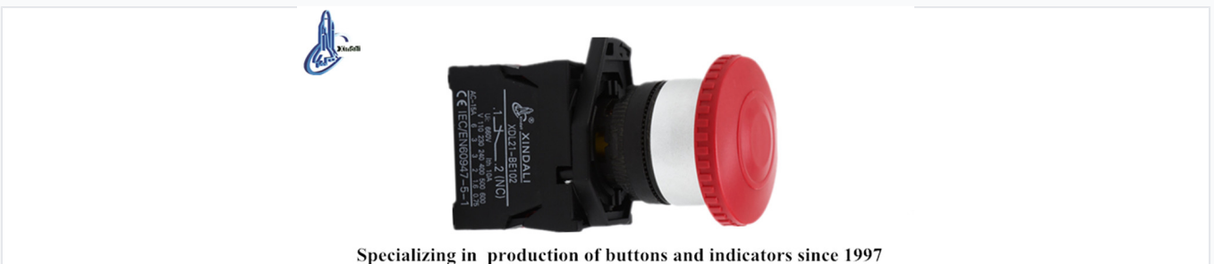
Specializing in production of buttons and indicators since 1997

Detailed view of the actuator and contact block specifications.