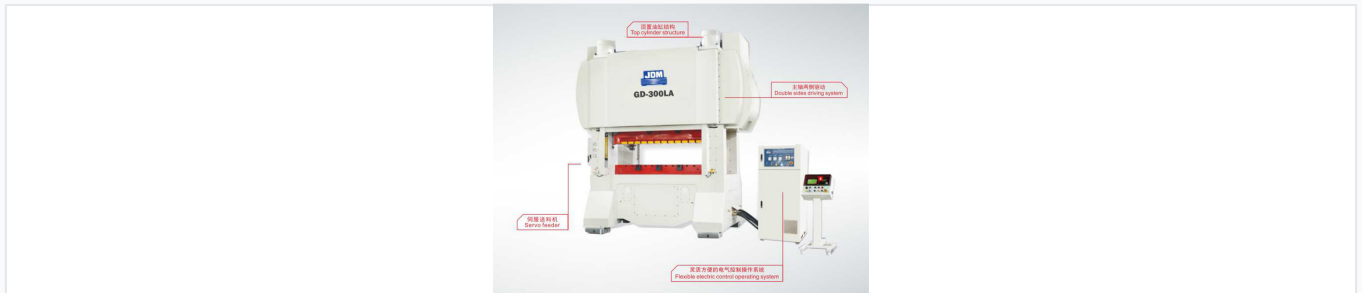
High-speed press featuring top cylinder structure and double-sided driving system.