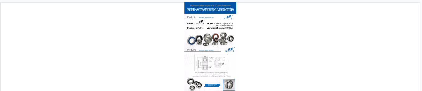
Detailed view of the basic structure including outer ring, cage, balls, and inner ring components.