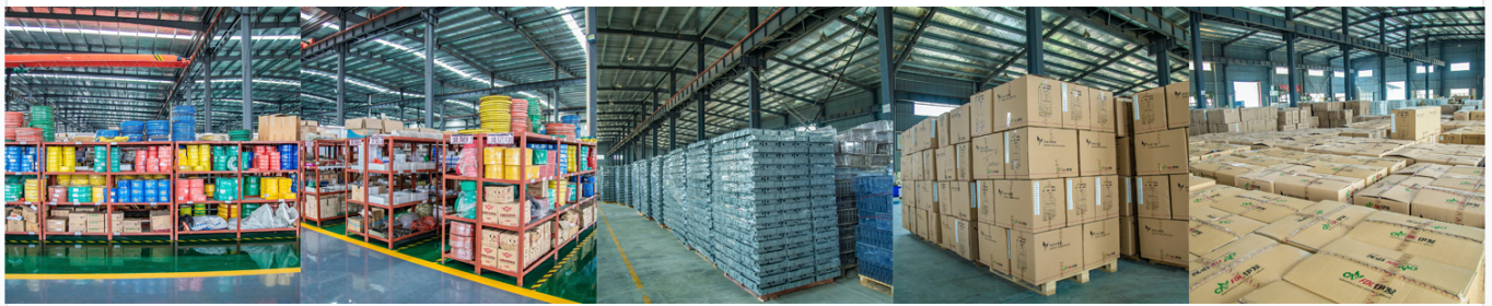
Standard modular socket designed for flexible electrical power distribution systems.