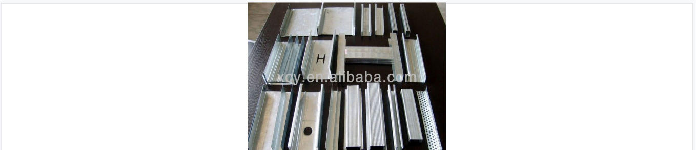
Full view of the roll forming line featuring the main body, motor, and control station.