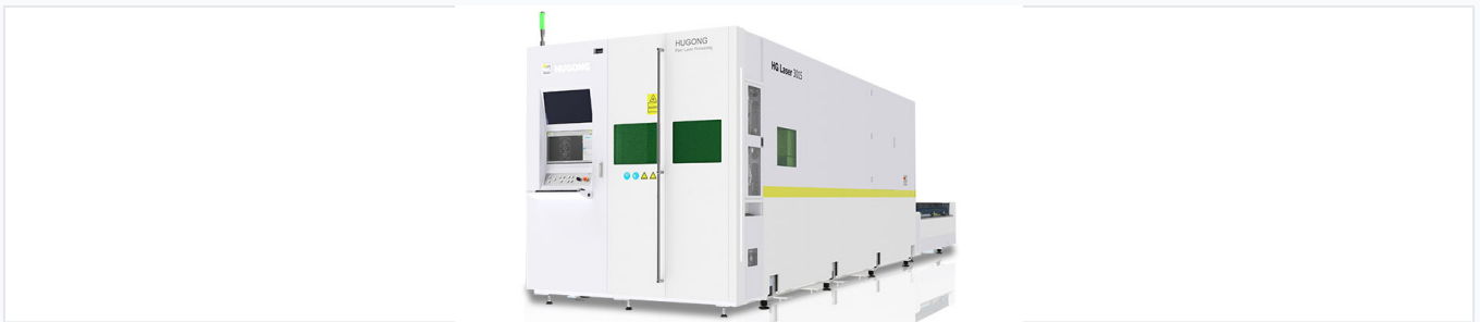
High-precision fiber laser cutting machine designed for industrial applications.