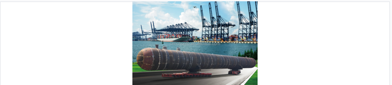
Technical design view of the LPG mounded tank structure.