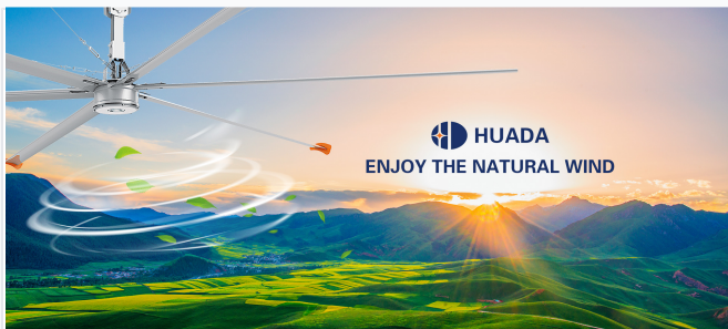
Engineered for optimal air circulation, providing a natural breeze experience in large spaces.