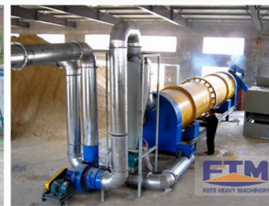
A complete rotary drying assembly featuring integrated heating and airflow components.